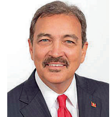
Charles Fernandez Minister of Tourism and Investment

instance, Barbuda will soon be powered exclusively by the sun, thanks to a solar-and-battery hybrid-plant project called Green Barbuda that is funded by the UAE-Caribbean Renewable Energy Fund. When it comes to foreign investments in tourism, the hotel sector is currently very active, according to Fernandez. "There is interest in medical tourism, including medical cannabis and stem-cell industries, as well," he states.