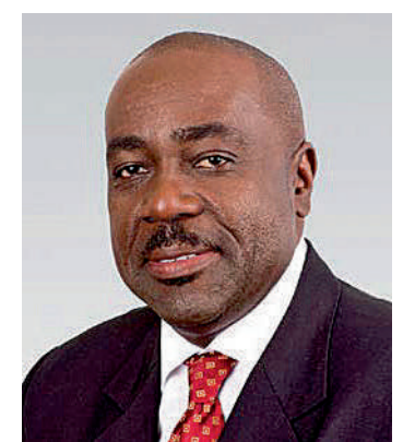
E P Chet Greene Minister of Foreign Affairs, International Trade and Immigration