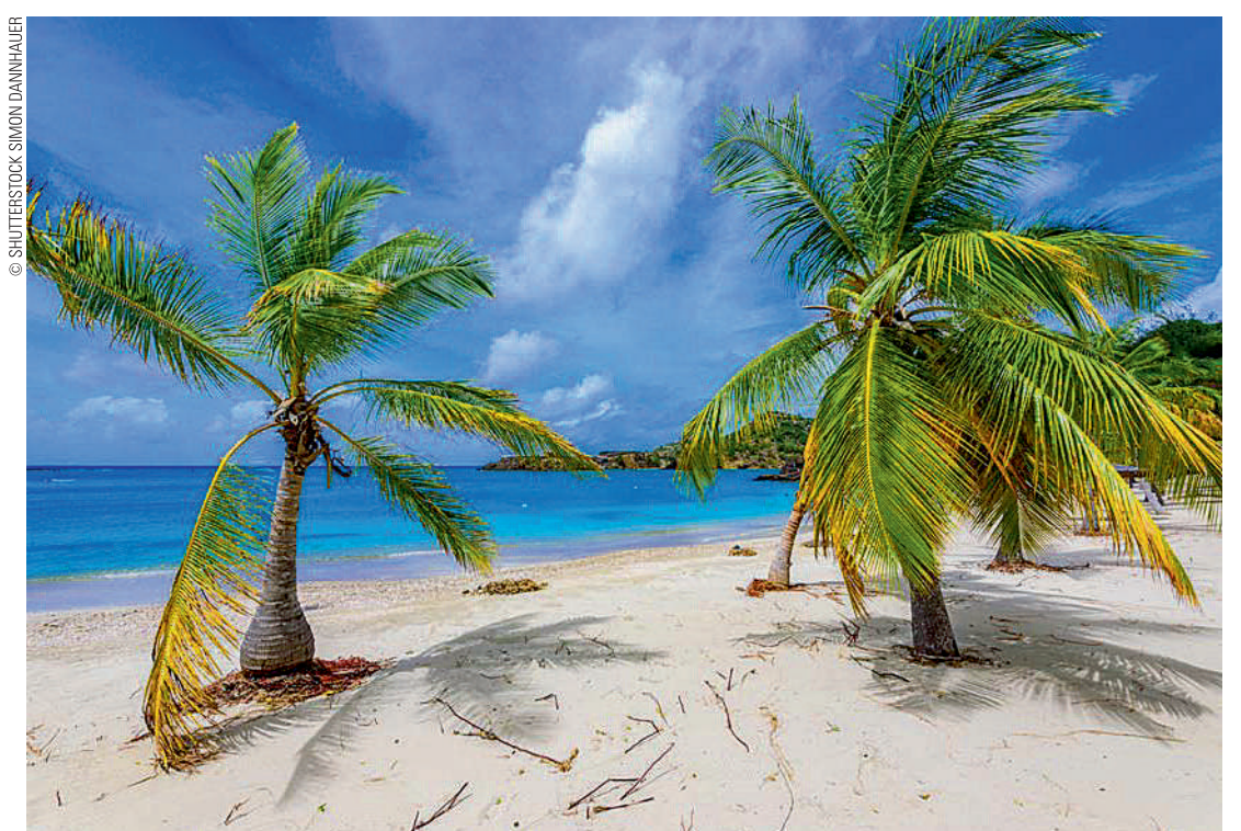
Antigua and Barbuda's new Nomad Digital Residence Visa opens up the islands to remote-working professionals

sandy beaches. "It has so much to offer: our friendly population, our vibrant and unique culture and cuisine, in addition to boasting historical gems and the lowest crime rate in the Caribbean. We have a fantastic sports tourism sector offering and hosting international events such ascricket, yachting, kite surfing, athletics and golf," he enthuses.